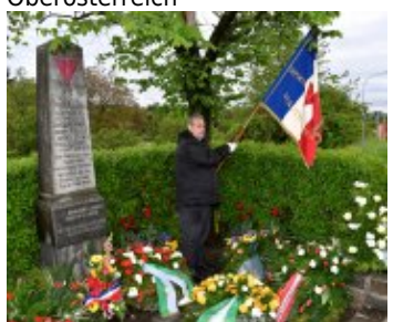
CC Monument, Haagerstraße Oberösterreich