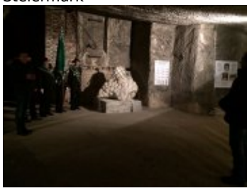
CC Memorial, Römersteinbruch Steiermark