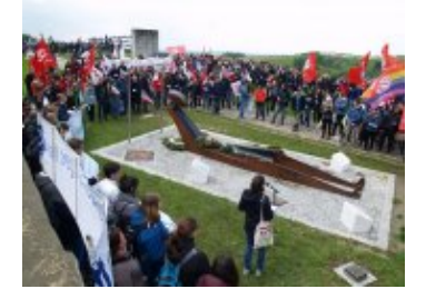
CC Memorial Mauthausen -Chapel Oberösterreich