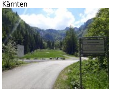
Memorial, Loibl Süd, Slowenien Kärnten